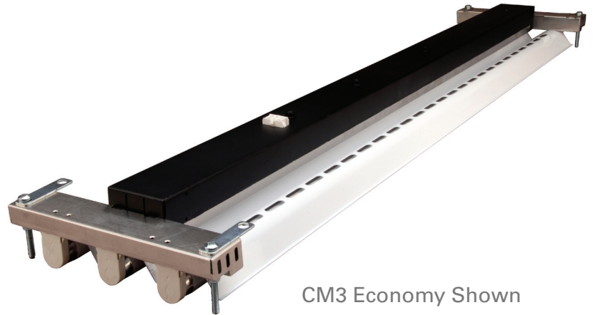
CM3 Economy Shown